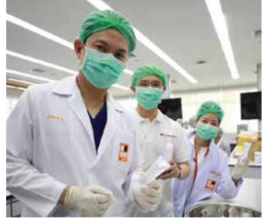
< Making KMITL GO Alohol gel for the community to help fight COVID-19